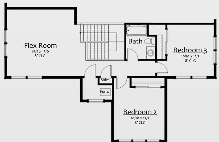
Modern Upper Floor Plan