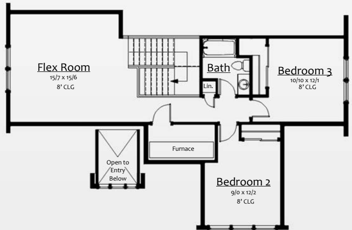
NW Traditional Upper Floor Plan